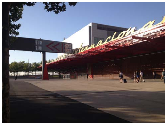
Early Friday morning outside the CCIB conference centre, which was the IFORS 2014 venue in Barcelona

Have you ever dreamed of being in a warm Mediterranean climate surrounded by fellow math-guys talking stochastic this and regression that, hidden Markov’s and colonies of ants? Dreams became reality for 2638 of our colleagues from 74 countries in mid-July when IFORS 2014 assembled in Barcelona, Spain, a beautiful city by any measure.