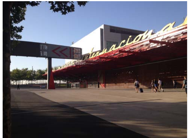
Early Friday morning outside the CCIB conference centre, which was the IFORS 2014 venue in Barcelona

Have you ever dreamed of being in a warm Mediterranean climate surrounded by fellow math-guys talking stochastic this and regression that, hidden Markov’s and colonies of ants? Dreams became reality for 2638 of our colleagues from 74 countries in mid-July when IFORS 2014 assembled in Barcelona, Spain, a beautiful city by any measure.