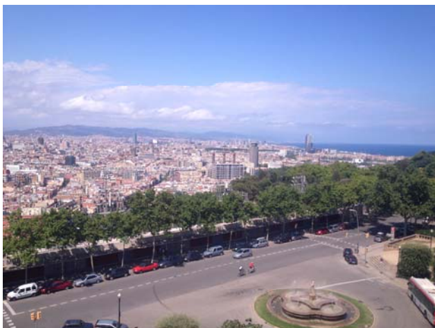
Barcelona, from the Mont Juis chairlift. The conference venue is on the coast, near the centre in this photo

But it was not all “work”. Wednesday was the mandatory rest-day and while some took a city tour others headed north to the Costa Brava and a day beside the sea. My day took me to the Savadore Dali Theatre-Museum in Figueres. Now that was a surreal experience!