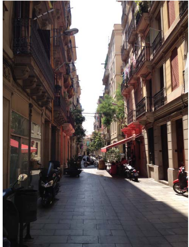
More Barcelona – this is part of Barceloneta, an area rapidly becoming a tourist village, but which was originally home to fishing families. Barceloneta lies between the redeveloped Barcelona port and the 1992 Olympic Village.

tutOR: http://www.tutor.ms.unimelb.edu.au