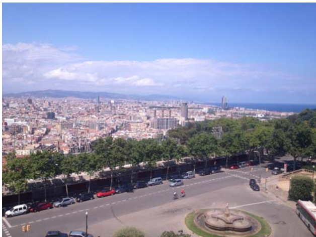
Barcelona, from the Mont Juis chairlift. The conference venue is on the coast, near the centre in this photo

But it was not all “work”. Wednesday was the mandatory rest-day and while some took a city tour others headed north to the Costa Brava and a day beside the sea. My day took me to the Savadore Dali Theatre-Museum in Figueres. Now that was a surreal experience!